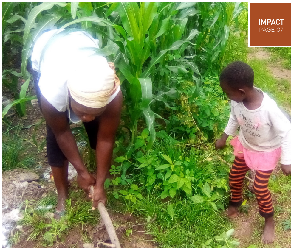
Widow tilling her crops